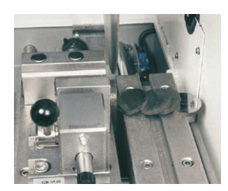
Quick acting clamping vise assembly