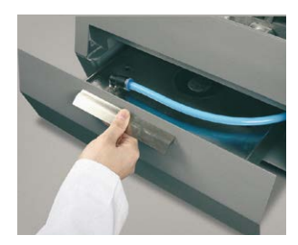
Recirculating coolant tank with 9 It capacity