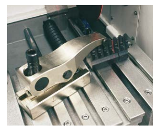
Vertical clamping device