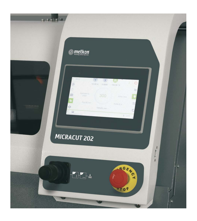
Coloured HMI touch screen controls with various cutting methods and database with cutting programs and maintenance monitoring

A library of 99 different cutting programs with related specimen name or number can be saved with all cutting parameters which can be recalled at any time. Data with Metkon cutting consumables is also listed for easy selection.