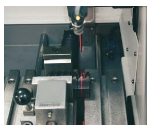
Laser Alignment Unit