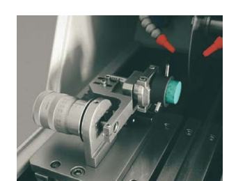
Manual X-axis positioning unit